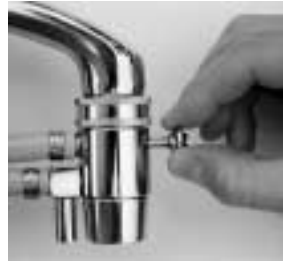
Figure 11 Turn on the faucet by pulling the diverter valve flow control knob outward. The unit will automatically come on.